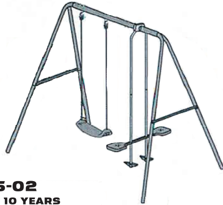
VENUS - M08605-02 FOR CHILDREN AGED 3 TO 10 YEARS